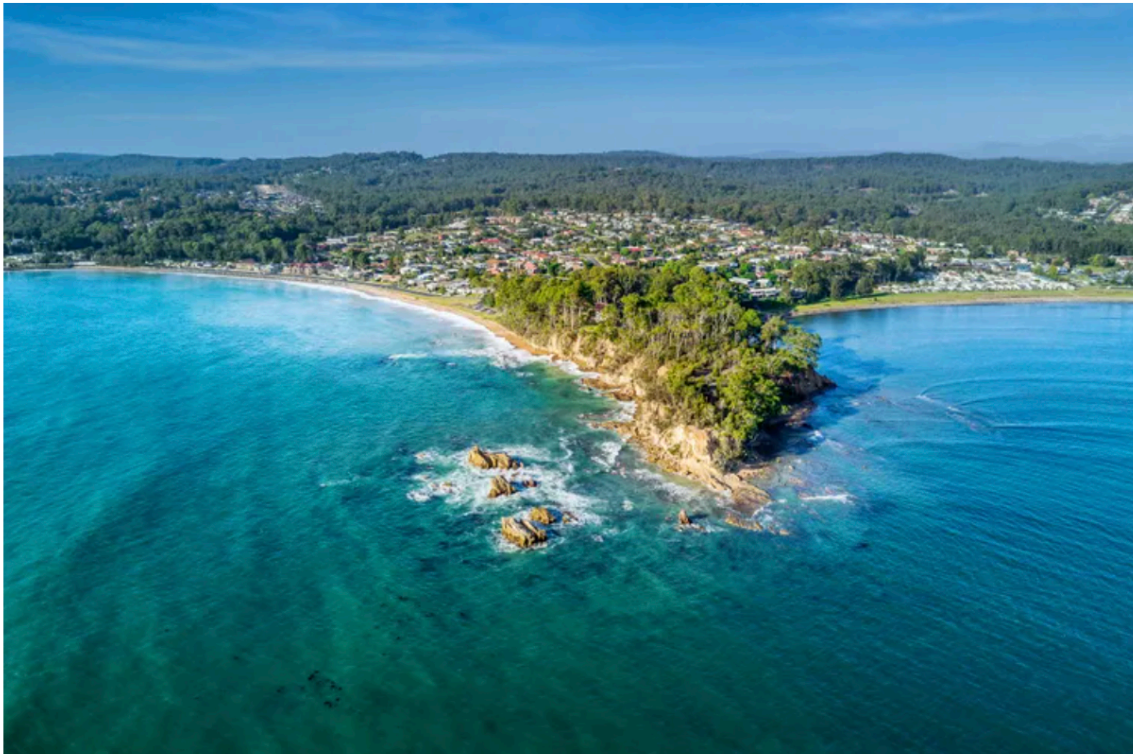
Batemans Bay, on the south coast of New South Wales, Australia.

For the mind, there are expert lecture and art programs and a vast range of “destination experiences” (aka shore excursions) and overland journeys designed to take residents deeper into each region.