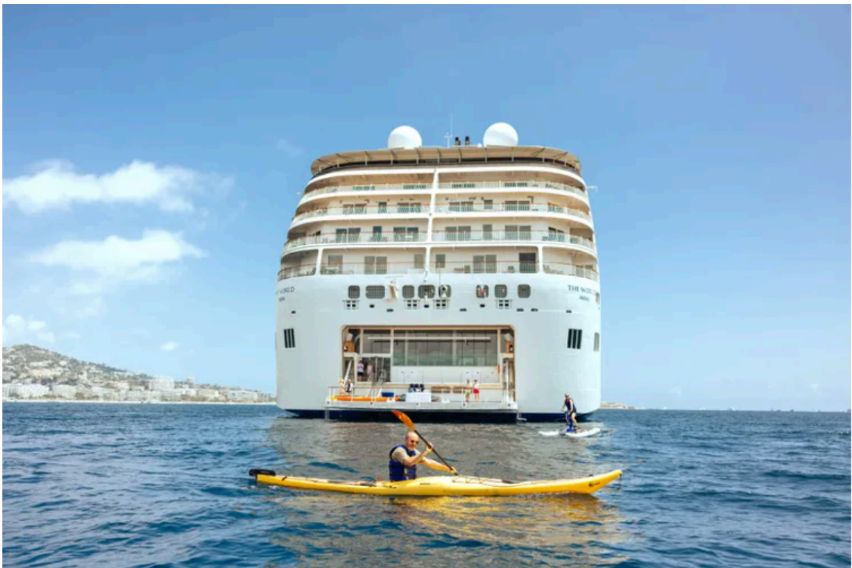
The World, a private residential yacht that offers residences at sea.

From multi-million-dollar apartments to Antarctic itineraries, life aboard this privately owned ship is built on community.