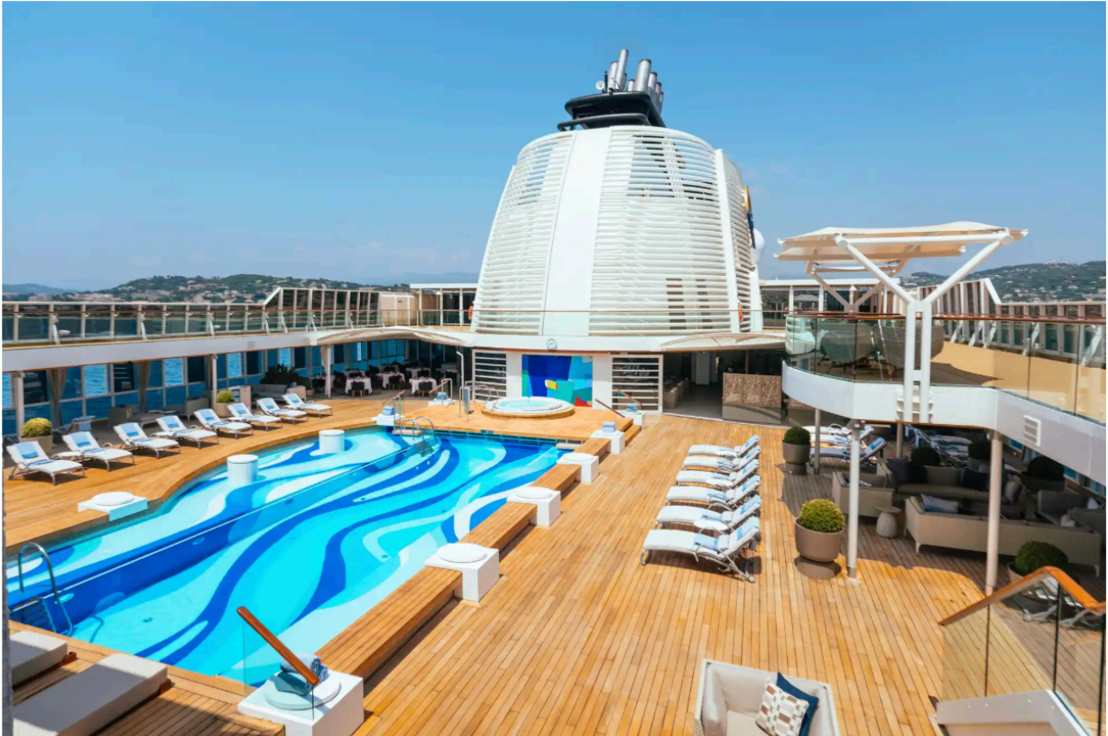
The World's pool deck.