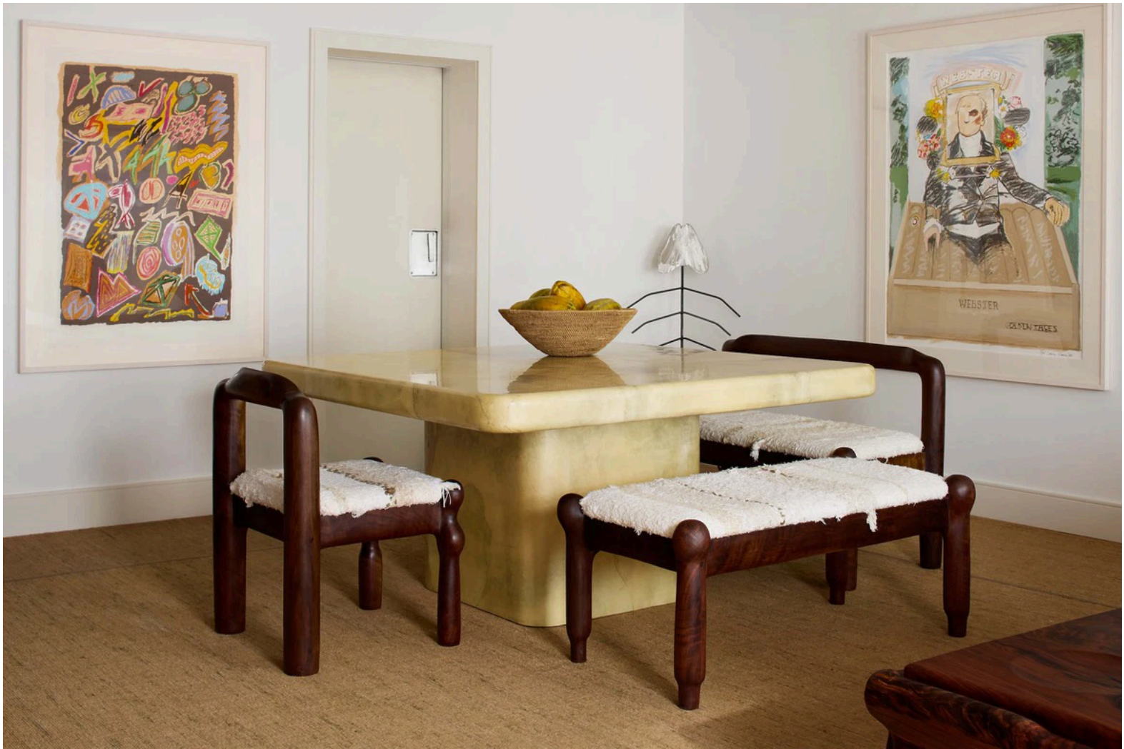
Artworks by Ida Rittenberg Kohlmeyer and Larry Rivers add bursts of color to the dining room.