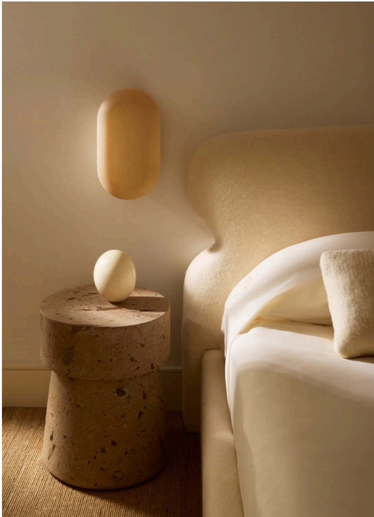
A fiberglass sconce by Faye Toogood for Matter Made, custom bed in cream wool felt by JG Switzer, and Rachel Shillander side table decorated with an ostrich egg from The Strangers Club Cape Town contribute to the guest bedroom's cocooning effect.

way to Italian fiberglass, a lighter material often used in shipbuilding, fabricated by Vava Objects with Aybar Gallery in soothing sea-green shades. Pearlescent zellige tiles provide a luminous backsplash and echo the Piet Hein Eek cabinet in the living room, a treatment repeated top-to-bottom in the primary and guest baths. Even kitchen shelving demanded careful scrutiny—each shelf includes a subtle lip to keep glassware and plates secure when the ship inevitably navigates choppy waters.