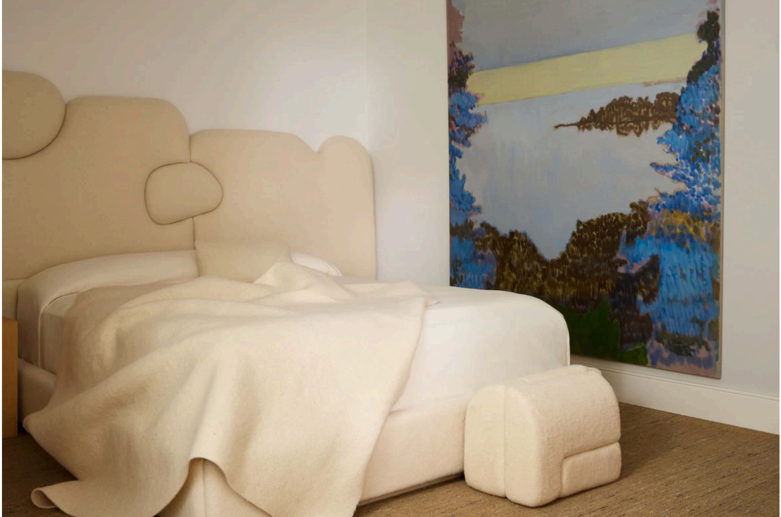
The primary bedroom is furnished with a custom bed upholstered in cream wool felt by JG Switzer, neighboring an oceanic painting by Morten Slettemeås.

periods. At one point, the primary bedroom's sizable painting of an ocean vista by Morten Slettemeås risked missing a delivery window. The contractor frantically drove to Seville to retrieve it with minutes to spare.