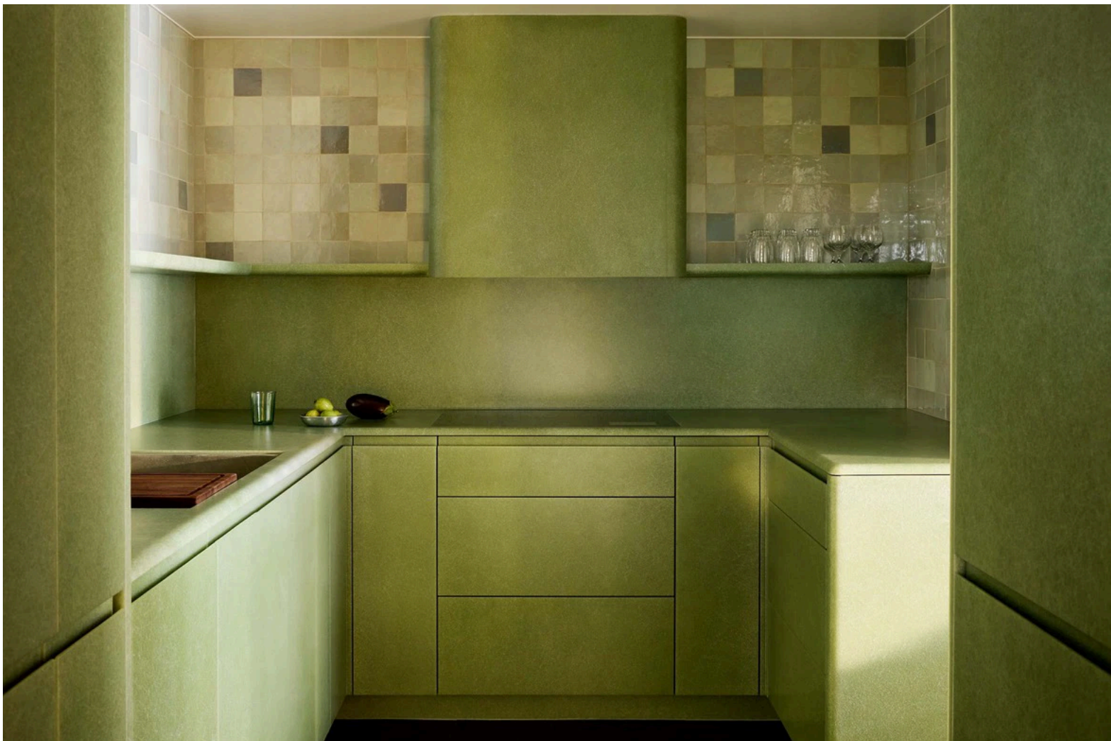
Aybar Gallery and Vava Objects fashioned the custom fiberglass kitchen, which features zellige tiles in sea-green shades by Davinci Marble and Clé Tile. The induction cooktop is by Sub-Zero Wolf.