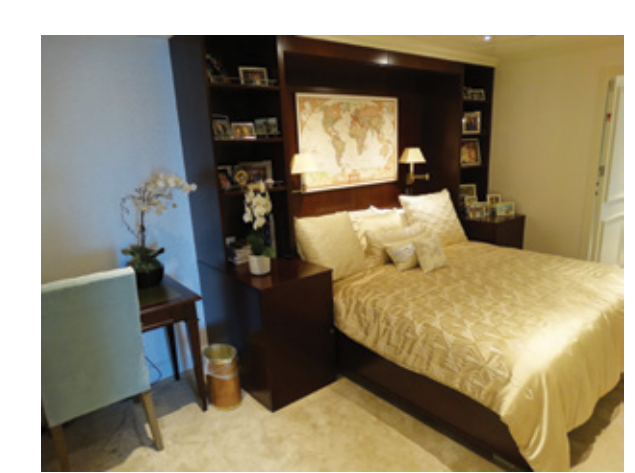
"It's all about knowing residents' personal preferences and delivering the highest levels of service."