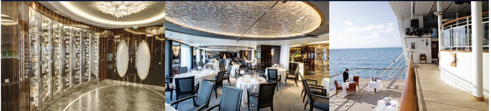
The World is more than a yacht or a cruise — with brilliant amenities, it's a true living space

Just discovered The World . And it's not what you think — in fact, it might be even better.