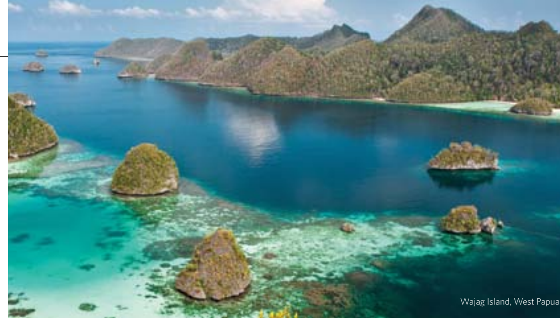
Wajag Island, West Papua

The word 'safari' typically brings to mind dirt tracks, tented camps, 4x4s, big cats and roaming herds. But imagine instead that the truck were a luxury yacht, the roads were azure seas, and the wildlife included Komodo dragons, birds-of-paradise, schools of manta rays and pods of dolphins. Welcome to one of Indo Yachts' sea safaris. Using its knowledge of Indonesia's 17,000 islands and access to some of the best luxury vessels in the region, Indo Yachts crafts the ultimate bespoke sailing adventures, allowing you to take in an astounding array of wildlife superyacht style. The sky is the limit when it comes to what is possible; as a preview, here is a special 10-day Elite Traveler itinerary in Raja Ampat aboard the award-winning 167-ftphinisi Dunia Baru .